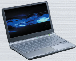
internet and intranet